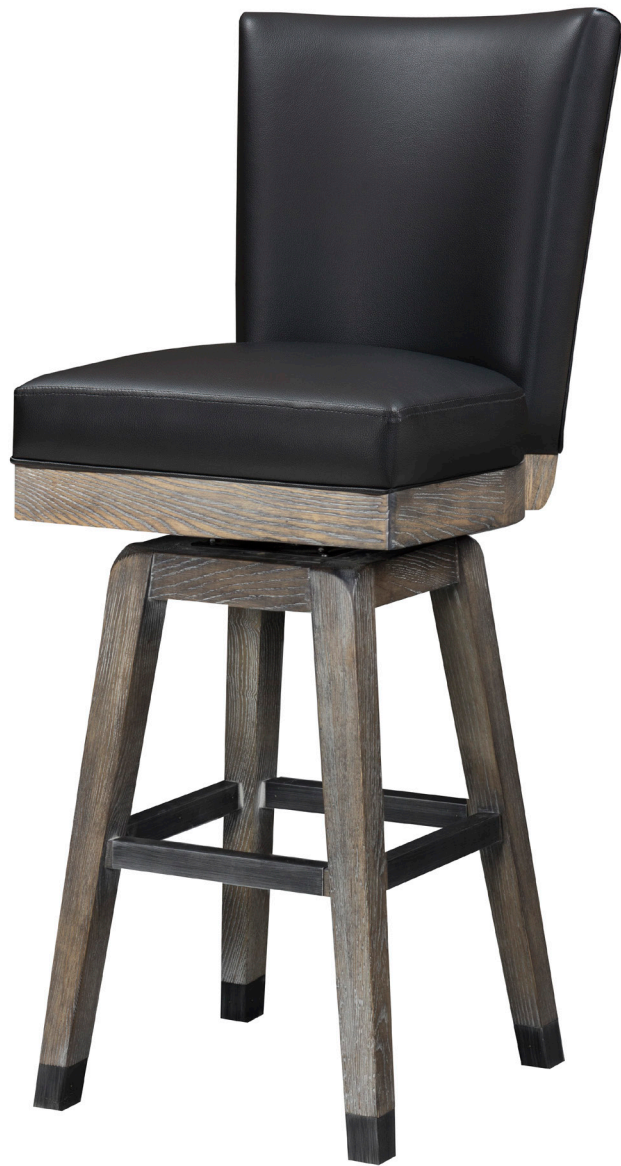
Shown in Smoke finish.